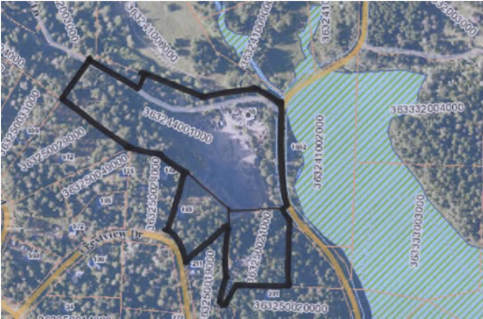
Map 2. Proposed MRLO area on TPNs 363244001000, 363250021000, and 363250023000.